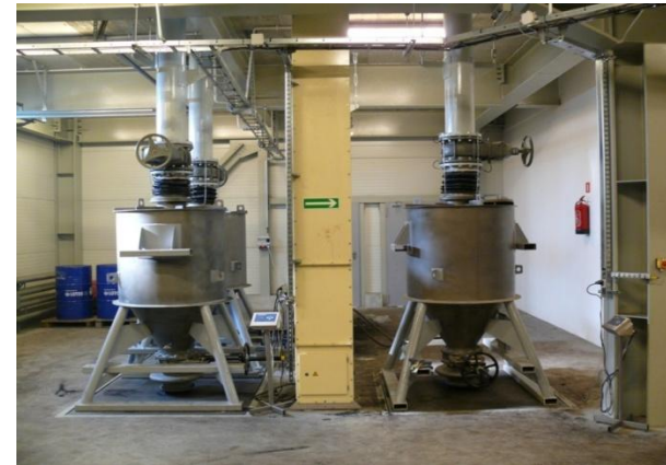
Coal transport containers and bucket conveyor