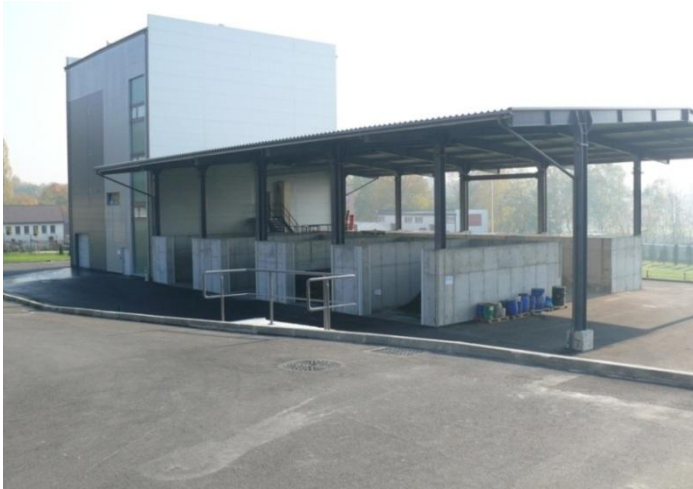
Section of grinding , screening and storing of coals.